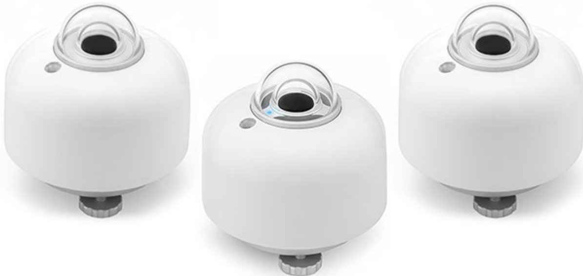
Figure 1 Industrial pyranometer models SR300-D1, SR200-D1 and SR100-D1. In front the leading Class A model SR300-D1, with heating, tilt sensor and the blue status LED. Left and right the non-heated Class A model SR200-D1 and Class B model SR100-D1.