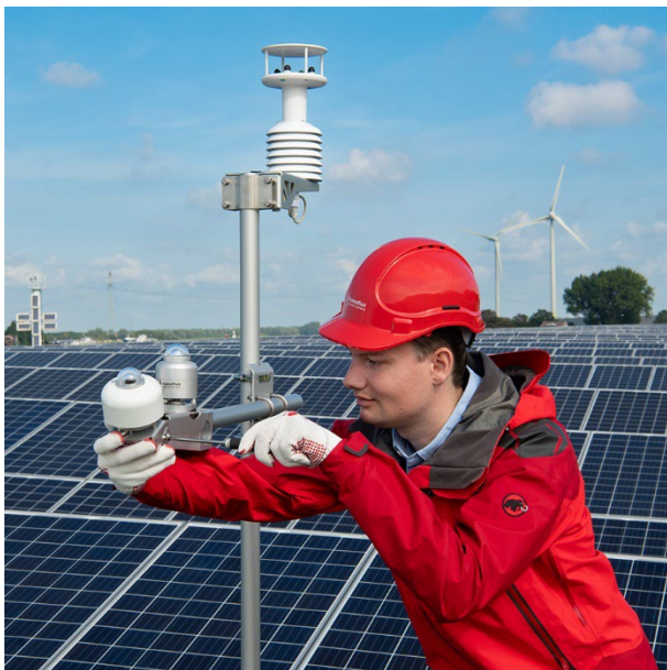
Figure 2 Typical use of pyranometers at PV power plants. The above picture shows two SR200-D1 pyranometers, one tilted for Plane of Array (POA) measurement, and another mounted horizontally for Global Horizontal Irradiance (GHI) measurement.

SR300-D1 and SR200-D1 both comply with IEC requirements for "Class A" PV system performance monitoring. SR300-D1 complies for all locations and climatic conditions, SR200 for climates in which dew and frost are not an issue. SR100-D1 complies with requirements for Class B.