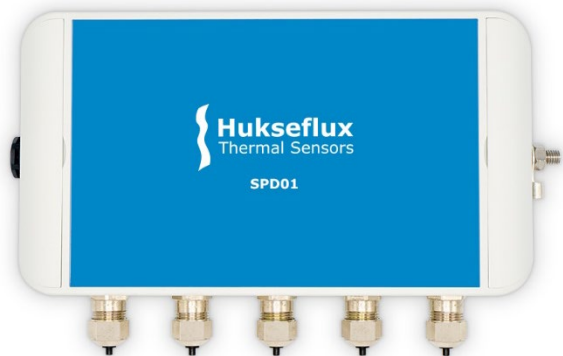
Figure 3 The SPD01 Surge Protection Device.