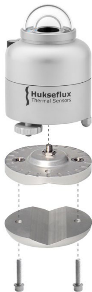
Figure 5 Optional spring-loaded levelling and tube mount for SR300-D1, SR200-D1 and SR100-D1. LM01 levelling mount (one part), TLM01 tube mounted (2 parts). Spring-loaded levelling is a major time-saver during installation.