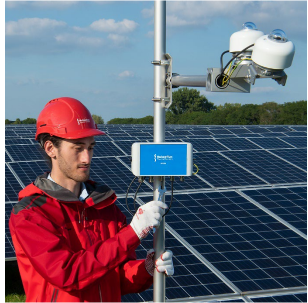
Figure 6 Two SR300-D1 pyranometers that are connected to the SPD01 Surge Protection Device. With the optional SPD01, you can upgrade surge immunity to Level 4.