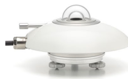
SR20 PYRANOMETER Secondary standard pyranometer