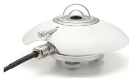
SR20-D2 PYRANOMETER Digital secondary standard pyranometer with Modbus RTU and 4-20 mA output