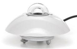
SR12 PYRANOMETER First class pyranometer for solar energy test applications