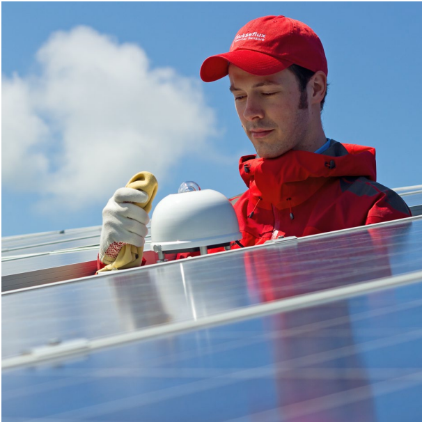
Figure 1 maintenance of SR20 secondary standard pyranometer with VU01 ventilation unit in PV system performance monitoring, measuring plane of array irradiance

Hukseflux offers a wide range of solutions for measurement of solar radiation. This brochure offers you general guidelines for selection of the right instrument. The application of pyranometers in PV system performance monitoring is highlighted as an example. Please contact us for further assistance.