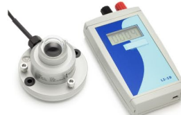
LP02 / LI19 PYRANOMETER Second class pyranometer with LI19 handheld read-out unit