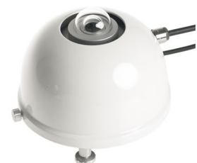
VU01 VENTILATION UNIT Ventilation unit for SR25, SR20, SR20-D2