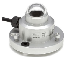
LP02 PYRANOMETER Second class pyranometer