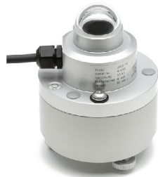
LP02-TR PYRANOMETER Second class pyranometer with 4-20 mA transmitter