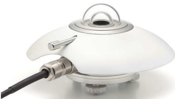
Figure 2 example of a Hukseflux pyranometer: SR25-D1 digital secondary standard pyranometer with sapphire outer dome. This model offers better data availability and measurement accuracy than traditional ventilated pyranometers. Its digital interface, using the industry standard Modbus communication protocol, allows for easy implementation and service