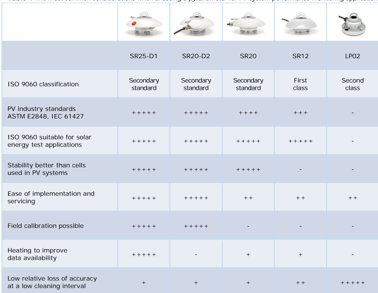
Table 1 The most common considerations when choosing a pyranometer for PV system performance monitoring application

In addition, the digital D1 and D2 sensors are suitable for field calibration by comparison to a reference instrument. Ask Hukseflux for more information on this latest best practice.