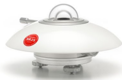
SR25 PYRANOMETER Secondary standard pyranometer with sapphire outer dome

Need for support in your selection process? E-mail us at: info@hukseflux.com