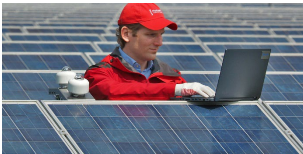
Figure 2 Two SR30 secondary standard pyranometers measuring GHI (global horizontal irradiance) and POA (plane of array) in a PV performance monitoring system