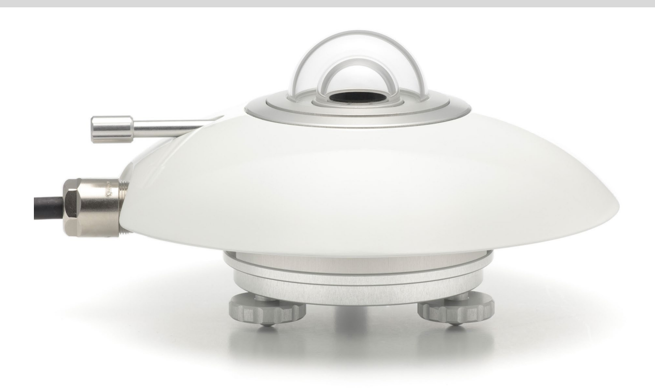
Figure 1 SR20 spectrally flat Class A pyranometer.

SR20 is a solar radiation sensor of the highest category in the ISO 9060 classification system: spectrally flat Class A. SR20 pyranometer should be used where the highest measurement accuracy is required. It is often used with data loggers that can directly accept its analog voltage output.