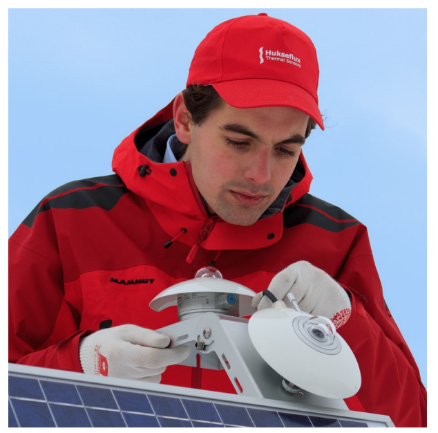
Figure 2 Dual setup in PV system performance monitoring.