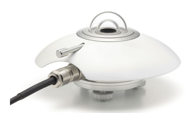
Figure 6 SR20 side view.