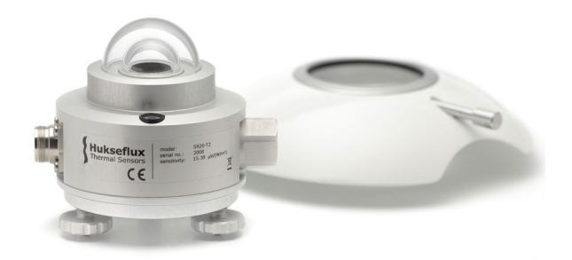
Figure 5 SR20 with its sun screen removed.

(1) cable, (2) fixation of sun screen, (3) inner dome, (4) thermal sensor with black coating, (5) outer dome, (6) sun screen, (7) humidity indicator, (8) desiccant holder, (9) levelling feet, (10) bubble level, (11) connector.