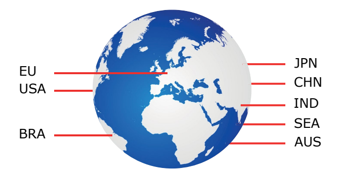
Figure 3 To reduce total cost of ownership: make use of the worldwide Hukseflux calibration organisation.

Pyranometers must be calibrated every 2 years. Such recalibration is considered good practice for any measuring instrument and is required by ISO, IEC and WMO standards covering PV system performance – and meteorological monitoring. Cost of recalibration, however, can be high. Hukseflux' worldwide calibration organisation will help you reduce these costs. Learn more about Hukseflux pyranometer calibration services.