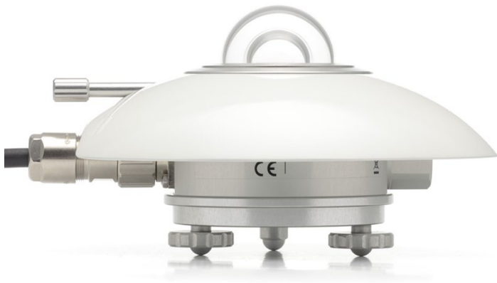
Figure 1 SR20 secondary standard pyranometer