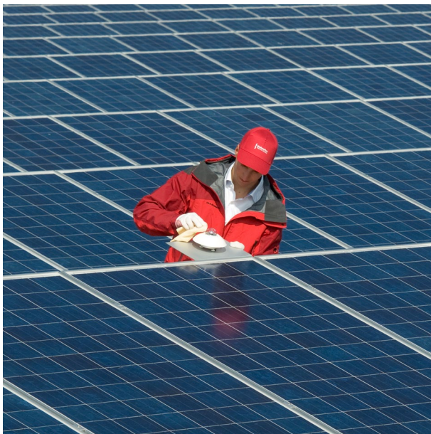
Figure 2 accurate PV system performance monitoring