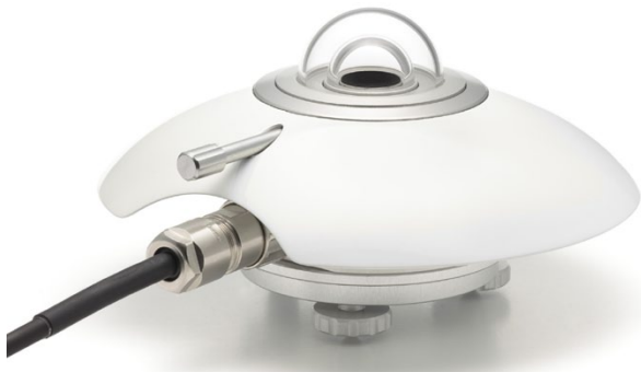
Figure 6 SR20 pyranometer side view

SR20's low temperature dependence makes it an ideal candidate for use under very cold and very hot conditions. The temperature dependence of every individual instrument is tested and supplied as a second degree polynomial. This information can be used for further reduction of temperature dependence during post-processing.