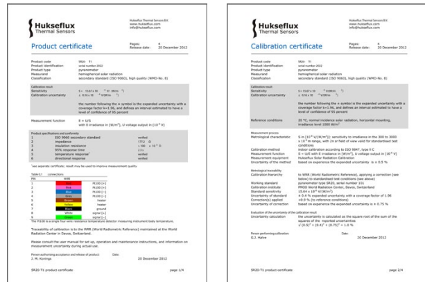
Figure 4 Hukseflux product and calibration certificates

The ISO/IEC Guide 99:2007 International Vocabulary of Metrology states that “type B evaluation of measurement uncertainty may be evaluated based on information obtained from the accuracy class of a verified measuring instrument” [1]. The ISO 9060:1990 standard, which covers pyranometer classification, demands for secondary standard pyranometers that “all specifications are tested for every individual instrument” [2]. In practice, the leading manufacturers of pyranometers test their secondary standard instruments, but not all supply these instruments with test certificates for the most critical specifications. These critical specifications are temperature dependence (this should be at least up to +50 °C for PV applications) and directional response (this should be up to 80 ° zenith angle in the extreme east and west directions for PV applications). Having the right certificates matters. By having these, you avoid any issues of liability.